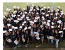
Overall performance of...

It also built the domes for the Emirates Palace Hotel in Abu Dhabi.