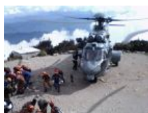
Death toll 19, say SAR officials