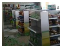
Strong earthquake strikes Sabah