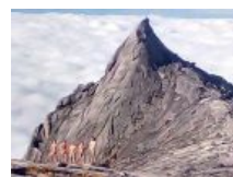
Sabah quake: Mount Kinabalu may be...