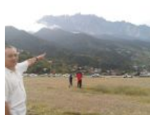
Sabah quake: A geologist's...