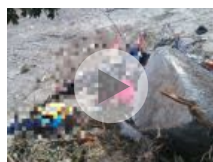
Sabah quake: Nine more bodies found