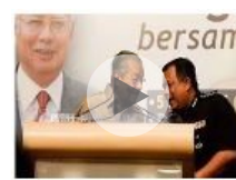
Nothing2Hide: Dr Mahathir stopped...